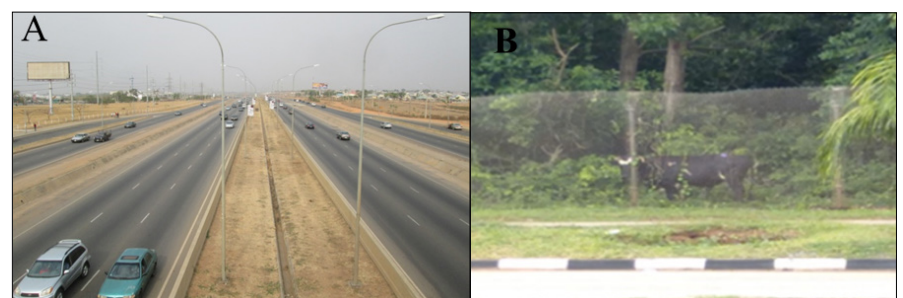
Figure 2: (A) Umaru Musa Yar'Adua Road in Lugbe and (B) the National Arboretum.