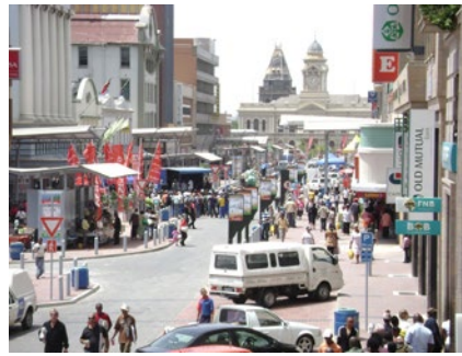
Figure 3: The upgraded Govan Mbeki Avenue

crime and grime as its key drivers (see Voges, 2013: 203).