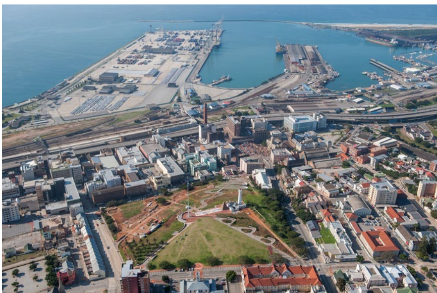
Figure 5: The Donkin Reserve upgrading