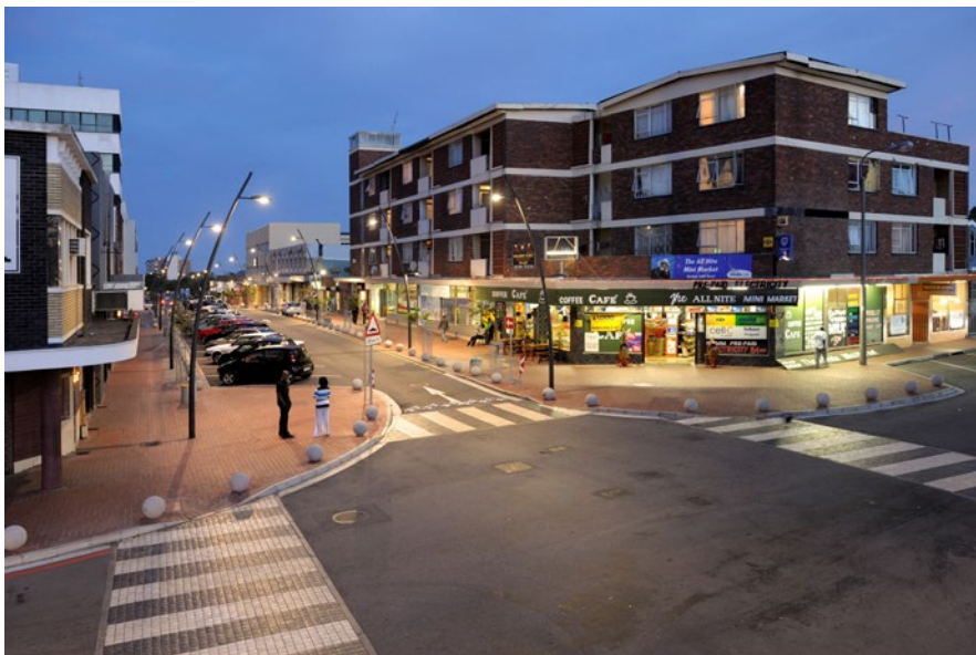
Figure 4: A lively section of the upgraded Parliament Street