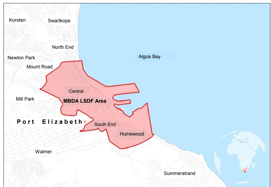
Figure1: The MBDA's original 'Mandate Area' in the wider Port Elizabeth CBD area

As a first step, the MBDA, using a team consisting of architects, urban economists and consulting engineers, developed a 'Master Plan' with a series of very detailed projects to be implemented over a fifteen-year period (Voges, 2013: 134). These projects were conceived, developed and researched from a market-demand, political, and social point of view, and with due cognisance of financial considerations. It was not only infrastructure that was considered and included in the plan, but also private sector-driven contracts (with service providers procured and managed by the MBDA) in areas such as security, cleansing, the regulation of informal trading, and the establishment of Special Rating Areas (SRAs). The resulting, overarching MBDA Master Plan was an approved City blueprint for urban renewal with local economic development benefits (Voges, 2013: 146). The overall objective was to conceptualise catalytic urban renewal infrastructure projects that would improve the quality of decayed public areas, and provide a platform for private-sector investment