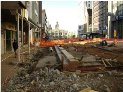
Figure 2: Upgrading of Govan Mbeki Avenue

Sustainability was a crucial consideration in the selection of infrastructure projects, the underlying ethos being that, “[i]f a public investment does not lead to downstream private sector investment, to sustain and deepen its role in the economic and social life of the area/city, then one cannot call it a successful public sector investment” (Voges, 2013: 154). The first of the MBDA’s public infrastructure-led projects, the pedestrianisation of what was then a very decayed area, the one-kilometre long former Main Street in the Central Business District (CBD), now called Govan Mbeki Avenue, in 2006 at a cost of R95 million, is a good example of this approach (see Figures 2 and 3 indicating the work on, and result of the pedestrianisation of the street).