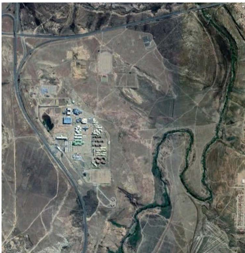
Figure 2: Google Earth image of the UFS QwaQwa campus (4,993m camera height, -28.48167, 28.8275)

Note: floodplain is based on crude estimates; further modelling would be needed for exact determination