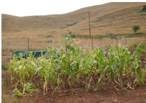
Photograph 3: May 2006

We could best observe the challenge of promoting resilience in the rural schools in terms of vegetable gardens. In urban STAR schools vegetable gardens were established within on average twelve months. Vegetable gardens went through prosperous and scarce cycles depending on climate, availability of labour and seeds, expertise and tools. Once teachers formed partnerships to initiate school-based vegetable gardens, produce was available in one form or another to share with children and their families. In the rural schools these patterns were quite different, as illustrated in Photographs 3-6.