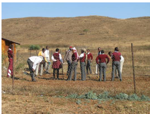
Photograph 5: October 2007