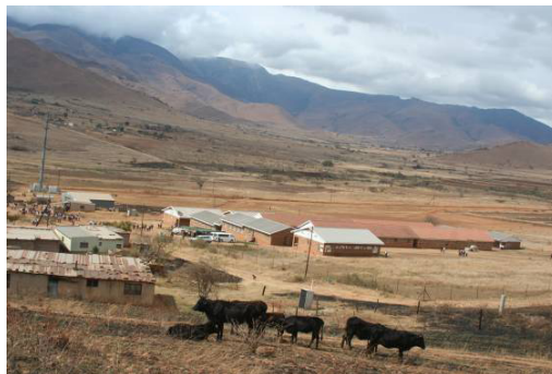
Photographs 1 and 2: Winter 2006 at the secondary school

What we describe in this article is another image that co-exists as reality with the realities referred to above. We present counter-illustrations of how teachers promote resilience in schools to balance numerous