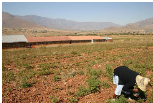
Photograph 4: May 2007