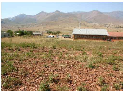
Photograph 6: January 2009

Teachers' agency to support initiatives remained noticeable as observed in the vegetable garden at the rural secondary school. An extensive area on the school grounds was ploughed by a farmer in May 2006 (Photograph 3); mothers weeded the garden in May 2007 (Photograph 4); learners and their teacher worked in the vegetable garden during a Biology class in October 2007 (Photograph 5); a fence was erected around a smaller vegetable garden in April 2008 and more soil turned in the terrain of the smaller vegetable garden in January 2009 (Photograph 6). Teachers also obtained seeds and tools from community members in April 2009, and assembled structures around young seedlings to protect them from goats in April 2010.