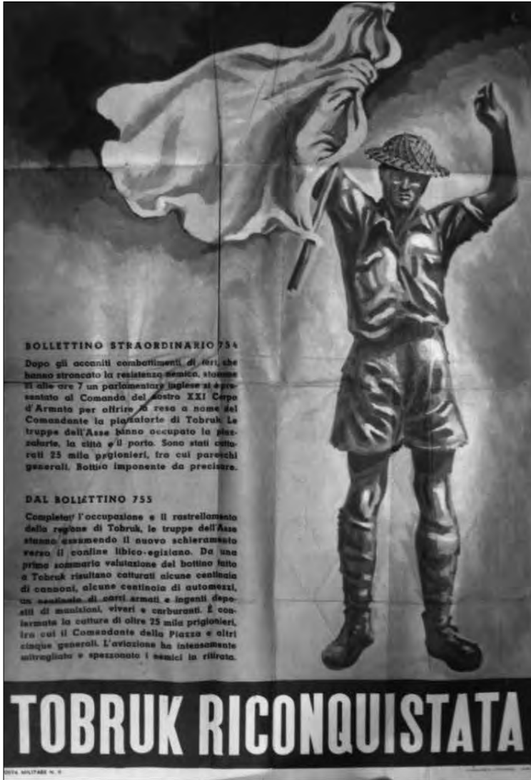
Figure 5: An Italian propaganda poster celebrating the re-conquest of Tobruk on 21 June 1942. Relief that the South Africans were not mentioned in the poster was expressed in a memorandum sent via the Union Defence Force Administrative HQ to the Chief of the General Staff. 99