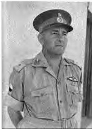
Figure 1. Major General HB Klopper. A picture taken somewhere in Tobruk

dearly in North Africa. Unlike Rommel, very little is known about Klopper and his career prior to the Second World War, an unfortunate historiographical situation affecting all but a few of South Africa's generals in both World Wars. 27 One has to be cautious in evaluating Klopper, that the stigma of having surrendered the garrison of Tobruk, after what was apparently a particularly poor effort, does not obliterate the facts. It is interesting that, despite this stigma that was to continually haunt him and despite his largely unsuccessful efforts to reverse adverse perceptions, 28 Klopper went on to enjoy a successful army career serving as Army Chief of Staff from 1951 to 1953, as inspector general (1953–1956), and as commandant general, head of the Union Defence Forces (1956–1958).