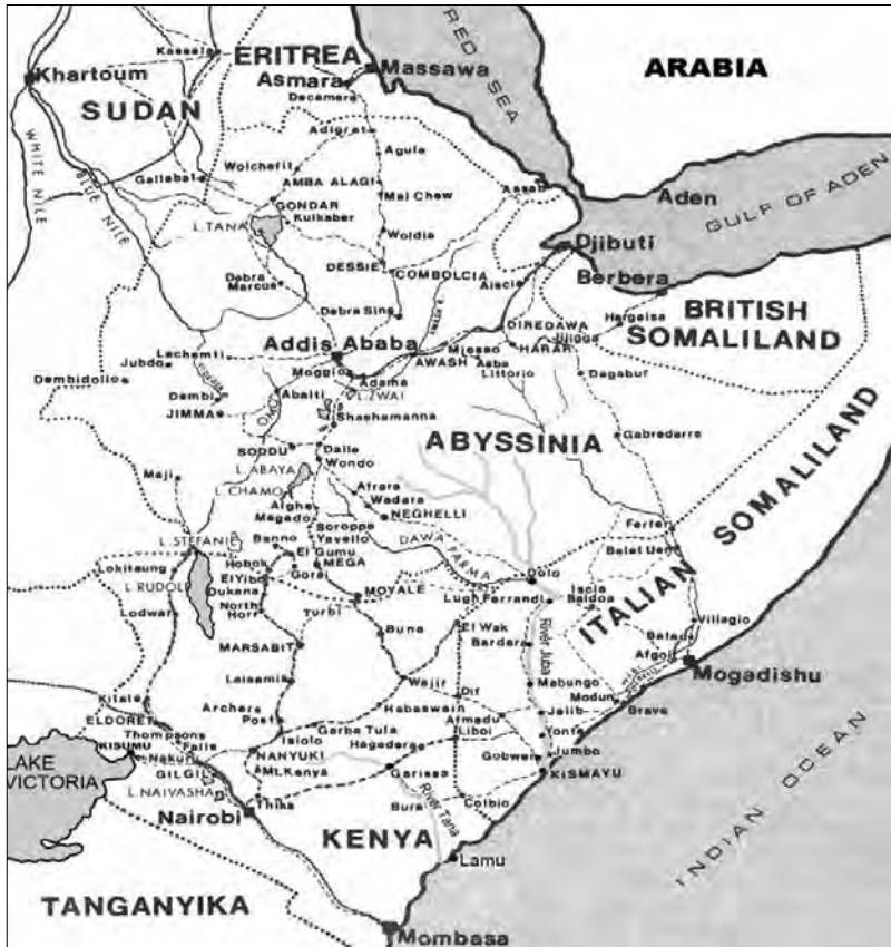
Figure 1. East Africa and Abyssinia, 1940 – 1941. 40