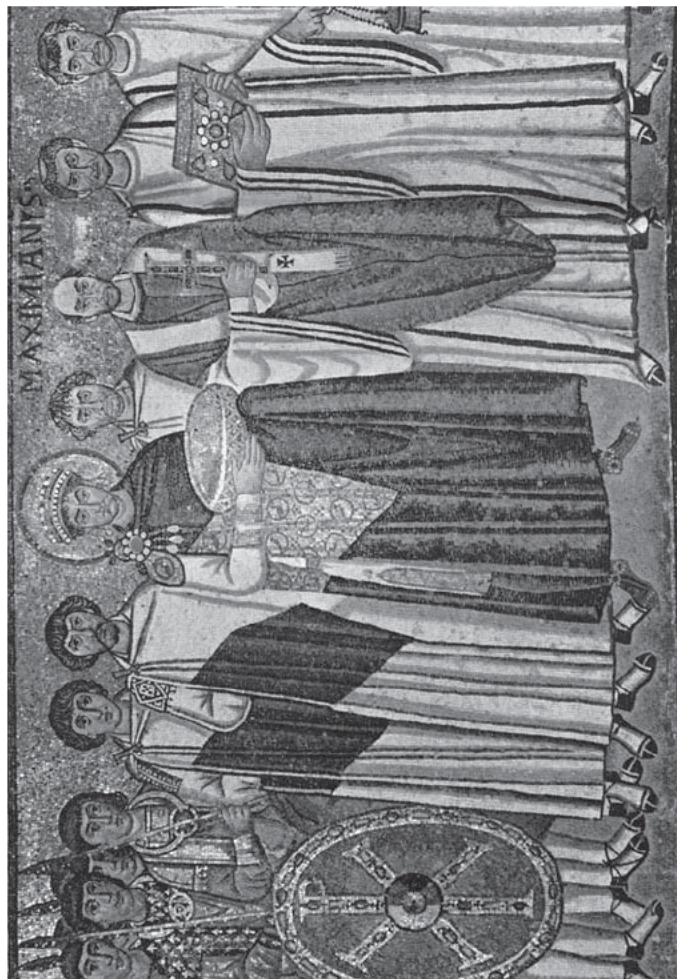
Figure 23: Justinian (527-565) and his court. Mosaic from the Church of San Vitale, Ravenna, Italy.