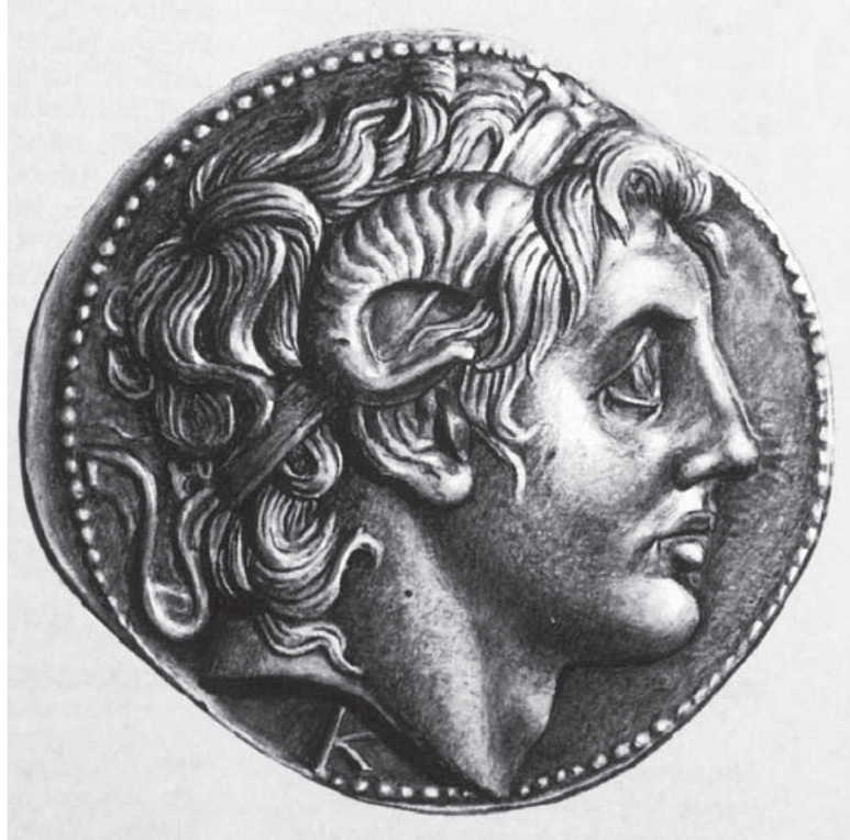
Figure 2: Silver coin from Thrace with the head of Alexander, portrayed wearing the horns of Zeus Amon, a god with both Eastern and Western ties.

Alexander's sudden death left his large and heterogeneous empire without a predetermined successor. This caused a protracted power struggle among his generals. Furthermore, the circumstances of his death soon became controversial — rumours of foul play and poisoning arose almost immediately, and were exploited by his contemporaries to further their own ends. The aim of this article is to review this historical event.