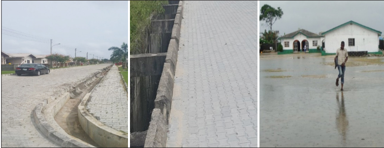
Figure 2: Well-serviced drainage system in government-led housing and flooded road, due to lack of drainage in self-help housing development area