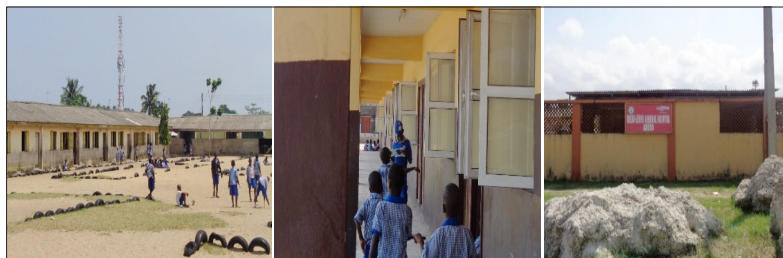
Figure 3: Public schools in Ibeju-Lekki peri-urban settlement