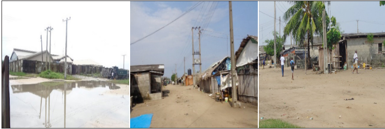
Figure 4: Untarred sandy road in Ibeju-Lekki; Block and plank walls; Thatch roofing and aluminium roofing in Ibeju-Lekki peri-urban area