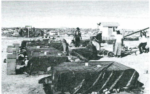
Photo 2: A CEB production yard showing sieving, pressing and curing, Mangaung, Bloemfontein (Jooste-Smit, P)