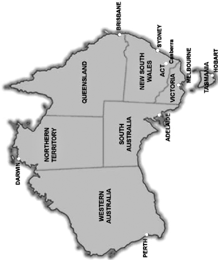
Figure 1 Australia, detailing statistical divisions. This map has been reproduced with the permission of the Bureau of Rural Sciences 2000