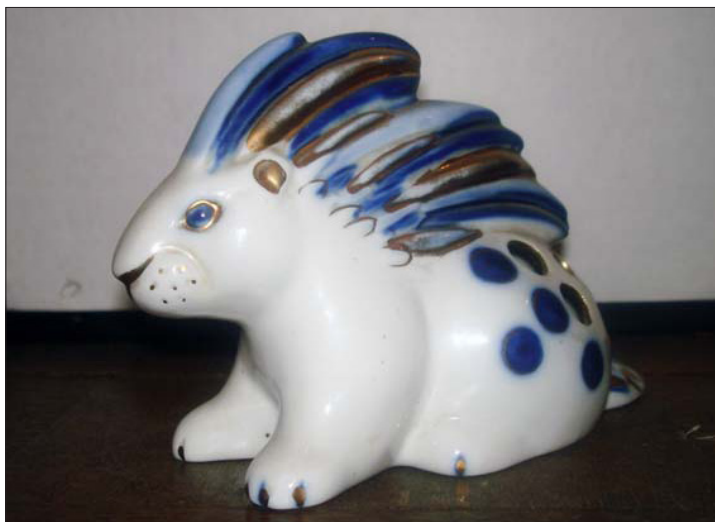
Fig 10. D. V. Gorlov. The porcupine-pencil 1950-e. Porcelain , overglaze painting