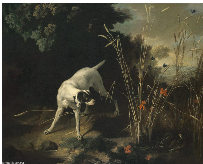
Fig 4. Udri Hunting dog on стойке 1725 Hermitage, St. Petersburg