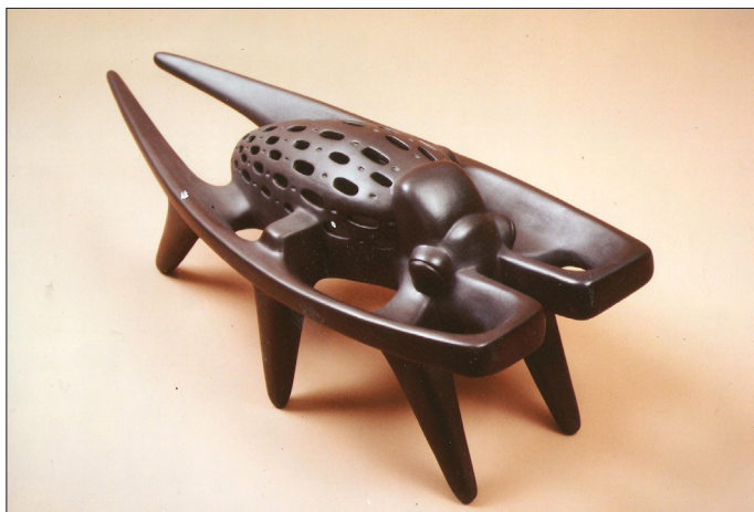
Fig 12. P. V. Khokhlovkin beetle. Ceramics, 1991. Biological Museum named after Timiryazev. Moscow