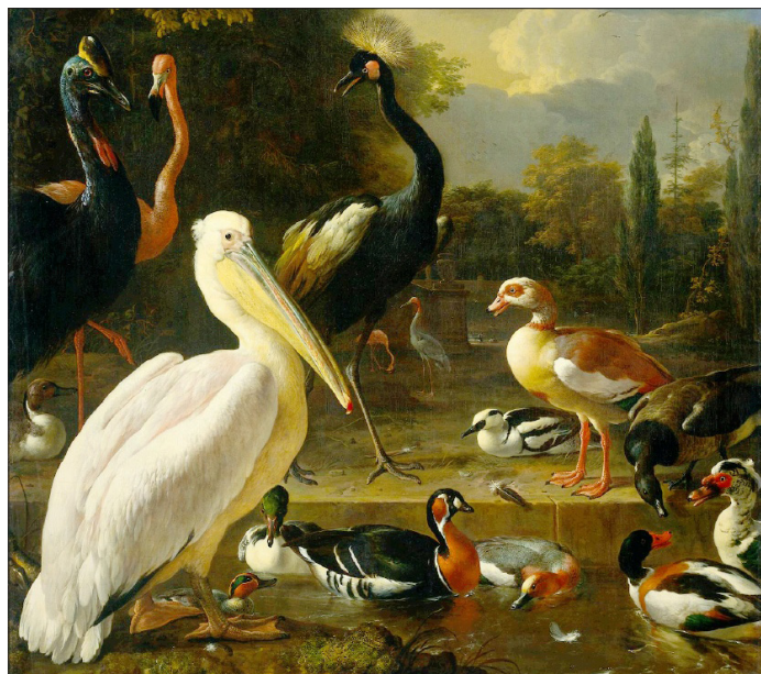
Fig 2. M. de Hondekuter birds in the Park 1680. Государственный Museum, Amsterdam, Netherlands