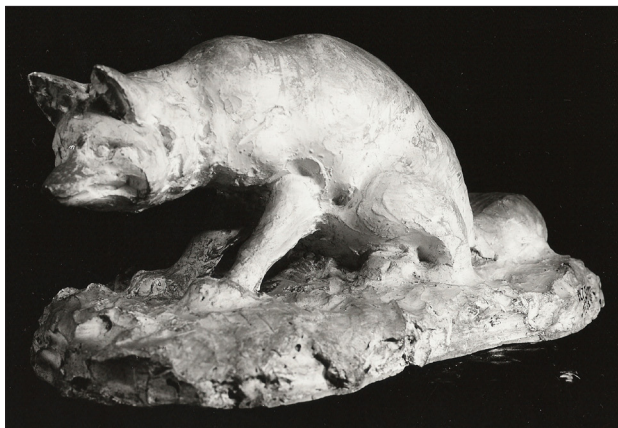
Fig 7. Andreev N. Fox.1903.gypsum. The state Tretyakov gallery (TG), Moscow

and poetic structure of art pieces that can be referred to as 'landscape-animalier' paintings. 'Plastic' images depict a simple and clear world view of Russian nature and animals.