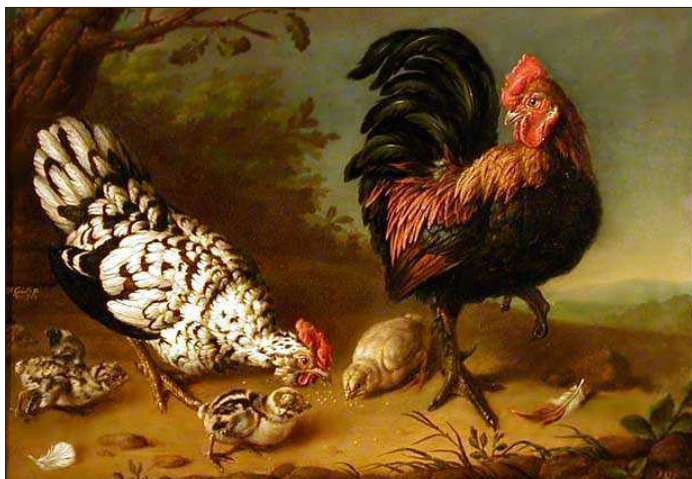
Fig 1. I. F. Groot Chicken family. 1767, The state Museum-reserve Gatchina