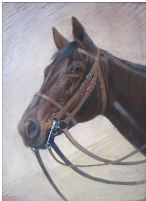
Fig 6. Crickets N. E. The horse's head. 1890-e, paper. on the cardboard. pastel. State Museum of horse breeding. Moscow