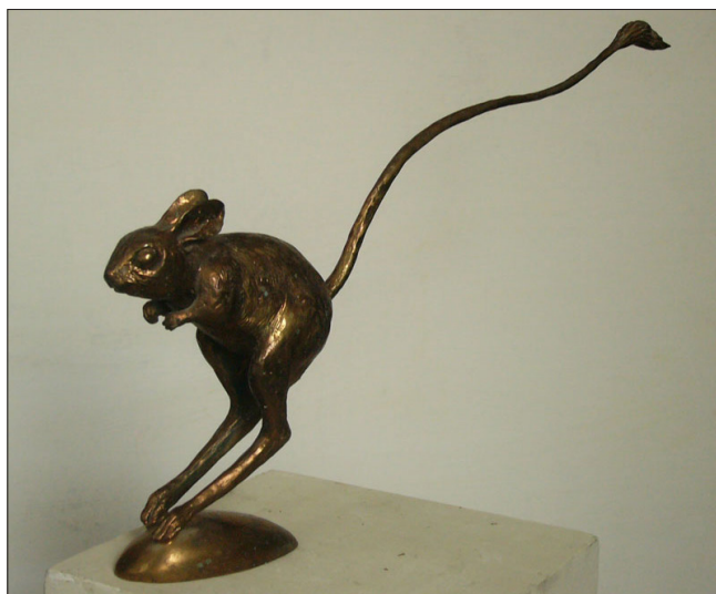
Fig 11. M. Ostrovskaya Jerboa. Bronze, 1980-e. Tretyakov gallery (TG), Moscow