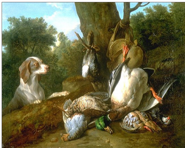
Fig 3. A. F. Deport. Still life with dog and game 1710. Hermitage, St. Petersburg