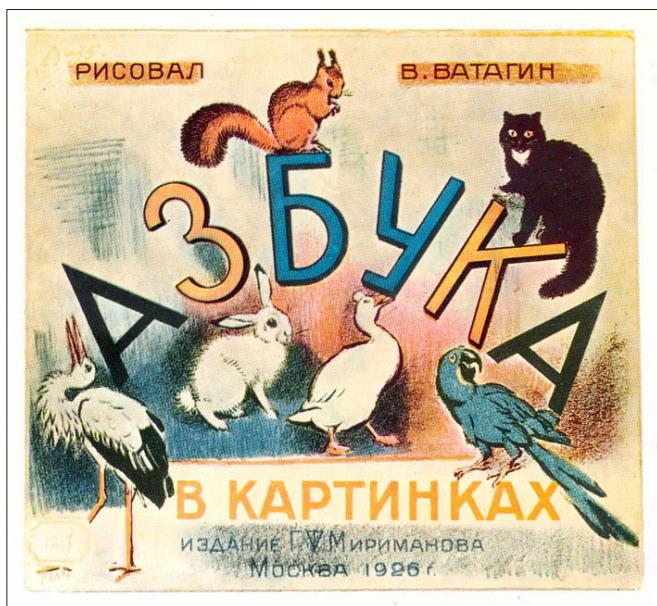
Fig 13. V. A. Vatagin the Alphabet in pictures