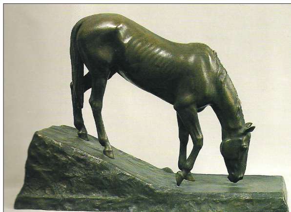
Fig 5. P. K. Klodt's Horse at a watering place 1850 Bronze. Timing